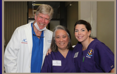
Amazing things happen when like minded people come together!