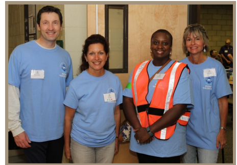
"We specialize in smiles"

I loved it! It was my first year volunteering. I can't wait to do it again next year. I have been in practice over 40 years and have never felt so good about being able to give back. ~Volunteer Dentist